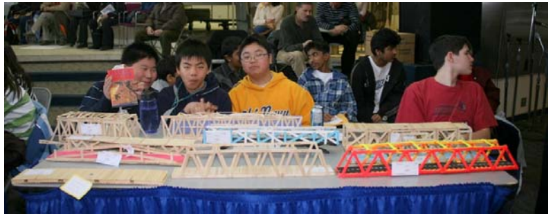
Young bridge builders and an assortment of colourful Popsicle Stick bridges at BBC 2008